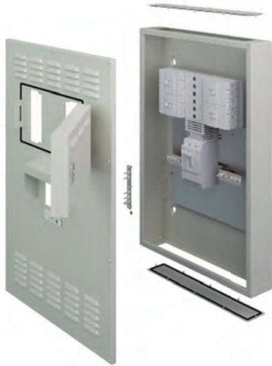
Bottom Entry Incomer

Incoming device ratings up to 250A – outgoing device ratings up to 160A