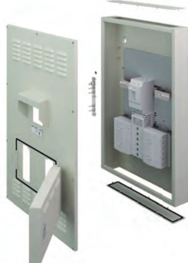
Top Entry Incomer