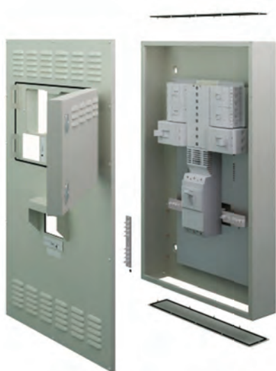
Bottom Entry Incomer

Incoming device ratings up to 400A – outgoing device ratings up to 250A